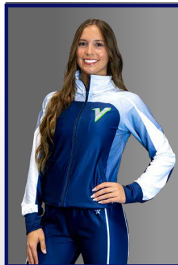
CheerVille Warm Up (optional)