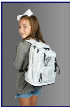
CheerVille Rebel Mini Dream Bag (optional)