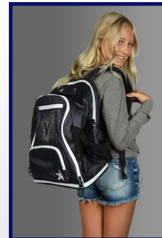
CheerVille Rebel Navy Dream Bag (optional)